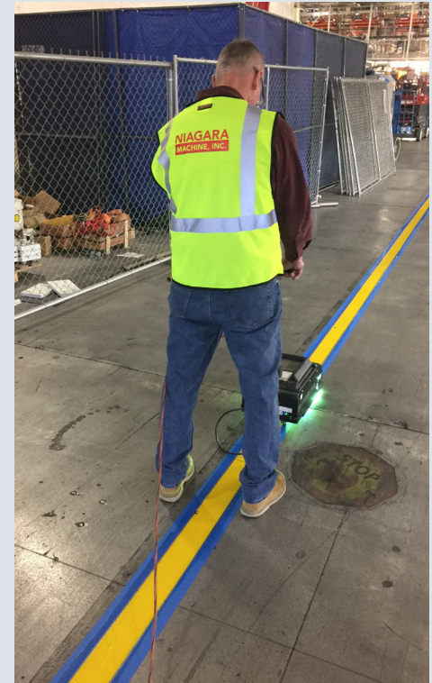
Employee and visitor safety in your facility will always be an important issue. Keeping danger areas free from unwanted traffic or directing traffic within a safety zone is a method to ensure human safety.

cleaning, DiamaPro UV-HS Plus outlasts other systems, extending the value of your flooring investment.